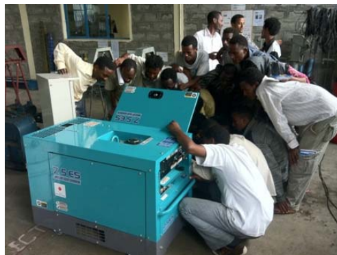
Lesson on how to operate a generator

In conjunction with this, EWTEC started training to upgrade the TVETCs' training capacity in January 2011. As of August, EWTEC had already conducted EMMT training for three TVETCs, in Jijiga, Awassa and Bahir Dar.