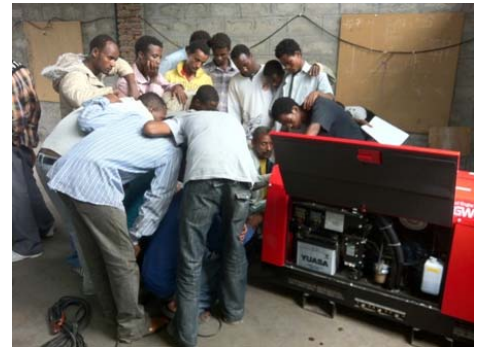
Lesson on how to operate a welding machine

Notes: Module 5 "Programmable logic controller" was included in the latest Bahir Dar TVETC training.