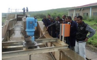
Field trip to sewage treatment plant