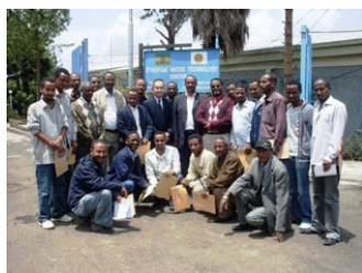
All participants of TOT

Through the training on EMMT at the three TVETCs conducted in 2011 and the needs survey result for TVETC training conducted by EWTEC and JICA in May 2011, it was recognized that there is a dire need to increase the technical level of TVET instructors.