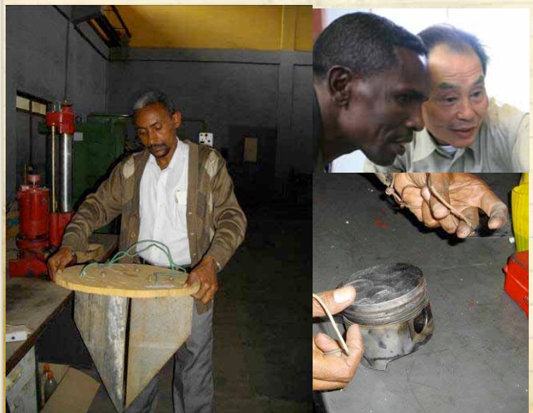
An example of tool of their own making

The coordinators and instructors are regularly interviewed as part of capacity building of EWTEC staff. That is called "Capacity Improvement System (CIS).